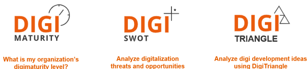
Fig. 2. Digitalization status analysis tools (positioning phase).

The toolset for positioning phase contains three tools (Fig. 2), starting from digital maturity analysis via SWOT analysis to DigiTriangle that sums up the digitalization development visions for the company. These visions are digitalization targets that the company wants to develop within a short- or long-term period.